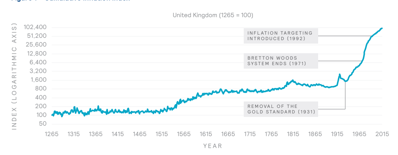
Figure 1 - Cumulative Inflation Index

A logarithmic axis has been used to ensure proportionate increases are scaled consistently. This means that a doubling of the index (a halving of the purchasing power of money), whether from 100 to 200 or 1,000 to 2,000, will appear the same size.