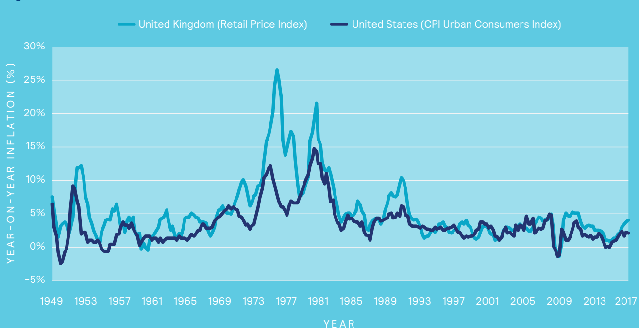
Figure 2 - Headline Inflation

Forward-looking views on inflation can sometimes take on an almost dogmatic dimension, with strongly held beliefs sitting at either end of the spectrum. At one end are those who argue that "inflation is dead," with this thesis often resting on a combination of central bank independence, the structural reduction in the strength of organized labor and technological disinflation. At the other end of the spectrum are those who argue that inflation is almost inevitable as unemployment levels reach secular lows, demographic trends begin to reverse and central bank "money printing" (quantitative easing) eventually flows into the real economy.